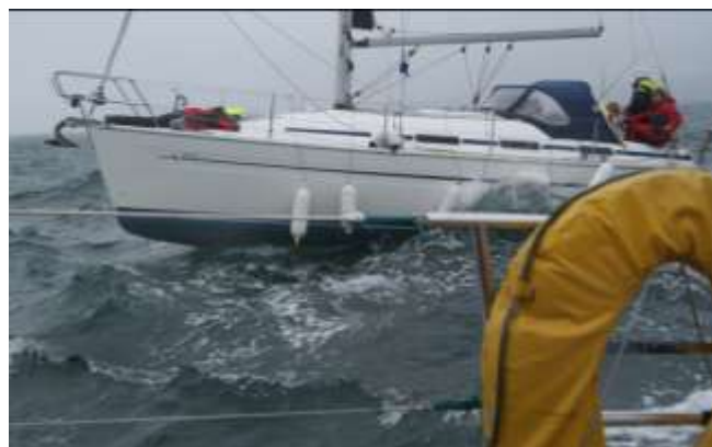
Waiting at the finish line

Obviously over a week the weather can change radically and this year at Pwllheli, although better than the gales of the previous year, there was competition